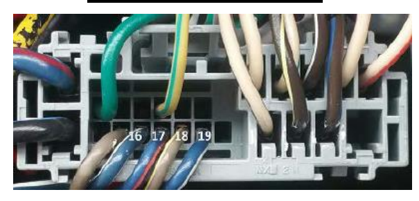
This is the view of the radio connector in the vehicle (note: wire colors may vary between vehicles)