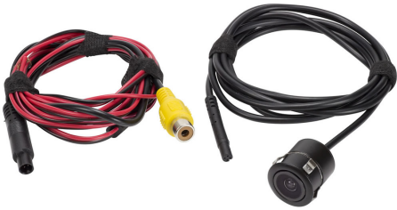
Camera and wiring