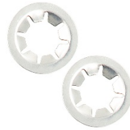
2 Push nuts